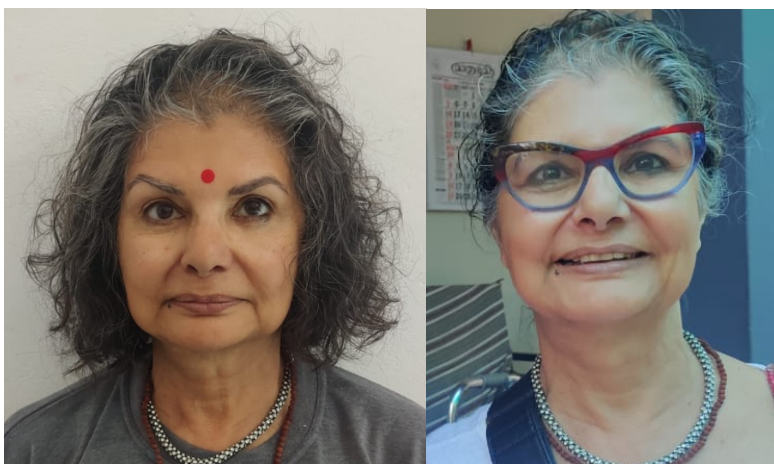
This patient, shown on Day 1 (left) and Day 25 (right) of her treatment, went from 132 to 116 lbs. during her month-long stay without dieting. Almost one year later, she's maintained the weight loss.

Do you treat _____? [fill in the blank with your medical condition] In modern medicine, all treatments are based on the medical diagnosis. Ayurveda has a different approach. We look at individuals and tailor the approach to try to improve their overall balance, whether that's in their nervous systems, posture, muscle strength, flexibility, stress levels, or their doshas (vata, pitta, and kapha), which Ayurveda uses to categorize each person's biology. When we help people come into better balance, many health conditions, both physical and psychological, improve. As one example, nothing in our program is designed specifically to result in weight loss, yet when overweight people take our treatments, they typically drop a few kilos. In general, everyone who takes these treatments benefits. Exactly what form those improvements take, however, can't always be predicted. One testament to our treatments' effectiveness is the high percentage of patients who return. If you'd like to discuss our experience with patients like you, please call Krishna.